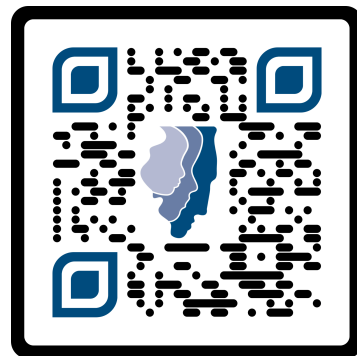
Day 2 Survey

Go to qrco.de/bfAC1z to fill out a quick survey on your experiences for Day 2.