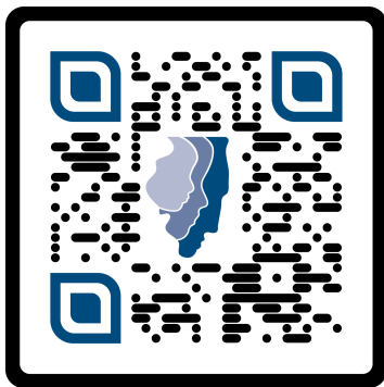
Day 1 Survey

Go to qrco.de/bfACMO to fill out a quick survey on your experiences for Day 1.